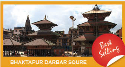
BHAKTAPUR DARBAR SQUIRE