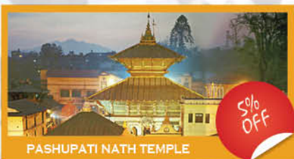
PASHUPATI NATH TEMPLE

TRIP HIGHLIGHTS : Nayapool, the courteous villages, intense Rhododendron, Dhaulagiri (8,167m) and Annapurna (8,091m) range, the stunning view of Sunset and Sunrise etc.