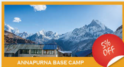
ANNAPURNA BASE CAMP

TRIP HIGHLIGHTS : Half day city sightseeing of UNESCO World Heritage sites in Kathmandu, Lukla, Namche Bazaar, Everest Base camp.