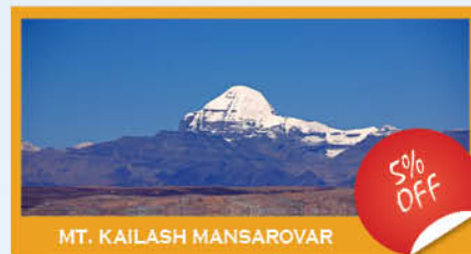
MT. KAILASH MANSAROVAR

TRIP HIGHLIGHTS : Covers most of the World Heritage Sites which are listed by UNESCO, elephant safari, walking, canoeing or boating in Rapti River, jeep safari, elephant bathing, watching wildlife, bird watching, Lumbini, Pokhara, etc.