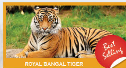
ROYAL BANGAL TIGER

TRIP HIGHLIGHTS : Bouddhanath Stupa, Pashupatinath Temple, Swoyambhunath, Kapan Gumba, Namobuddha, Lumbini, Mayadevi Temple, Ashoka Pillar etc.